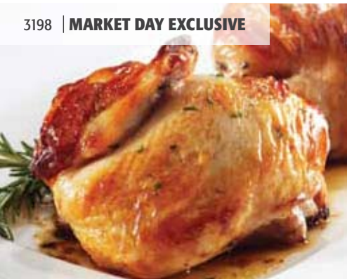
3198 | MARKET DAY EXCLUSIVE

NEW! 3366 Whole Grain PB&J Grahamwiches Smooth and creamy peanut butter and grape jelly layered in between crispy whole grain graham cracker wafers. Individually wrapped. 12-2.2 oz. sandwiches/$10.99 $9.99